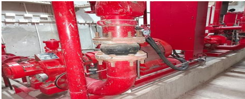
Fire Hydrant Systems